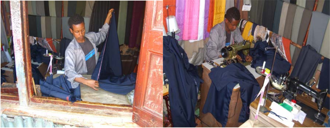
While a uniforms prepared (after once the 250 students' size had taken at school)