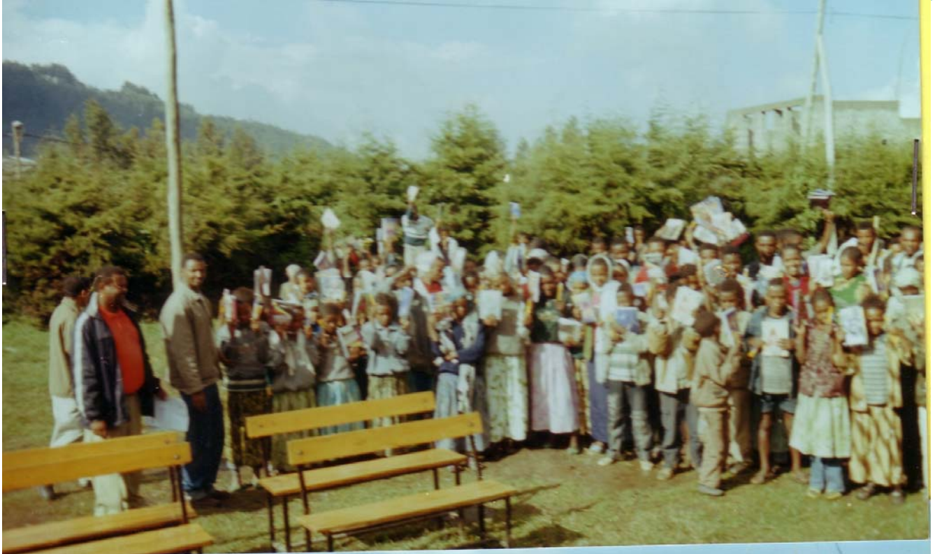
While the students were receiving their stationery