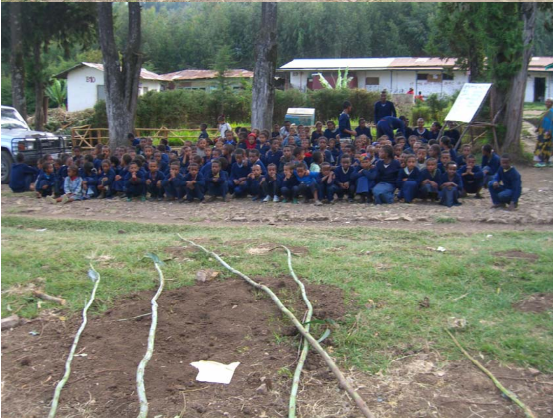
Teachers and targeted students expressed their thanks