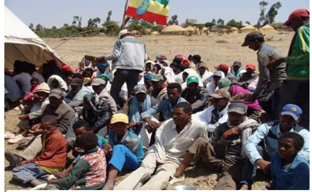
Some of the men, women and children enjoy the inaugural celebration

The next day we took the same bone-crushing road back to Gimbichu to visit the site of our 2016-2017 work with the Menjigso Gora Village. This is a series of villages (1,500 people) on a high plain overlooking a broad valley below. There is an old water point by a well that services these people, but some of the women and children have to walk up to 7 km one-way, and there are long line-ups. Nearby the well there is a stagnant pond where some people get contaminated water to avoid long wait times.