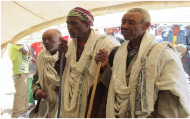
Three Elders from the Jejiga Village thank the Government, EKHDC and HORCO