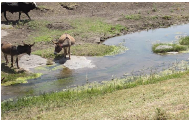
Original source of water used by generations of residents of Jejiga Village

However, as you see from the photos below, not much has changed in the Gimbichu District, 80-100 km to the east, where HORCO works with rural villages to develop clean water systems and effective sanitary practices. We attended the inaugural celebration of the clean water system completed with the Jejiga Village in 2015: capped spring, reservoir, three water points, animal troughs and clothes washing tables. It was a joyful event with speeches and some light refreshments including, of course, Ethiopian coffee!