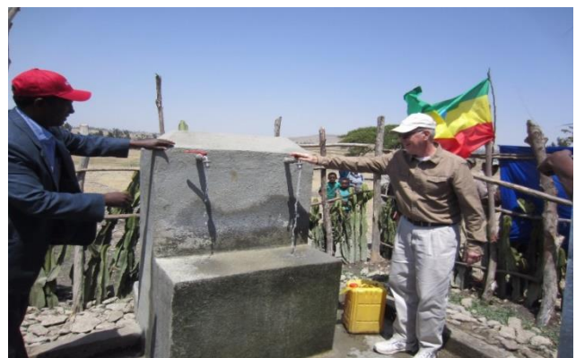
One of three water points delivering spring water, located throughout the Jejiga Village